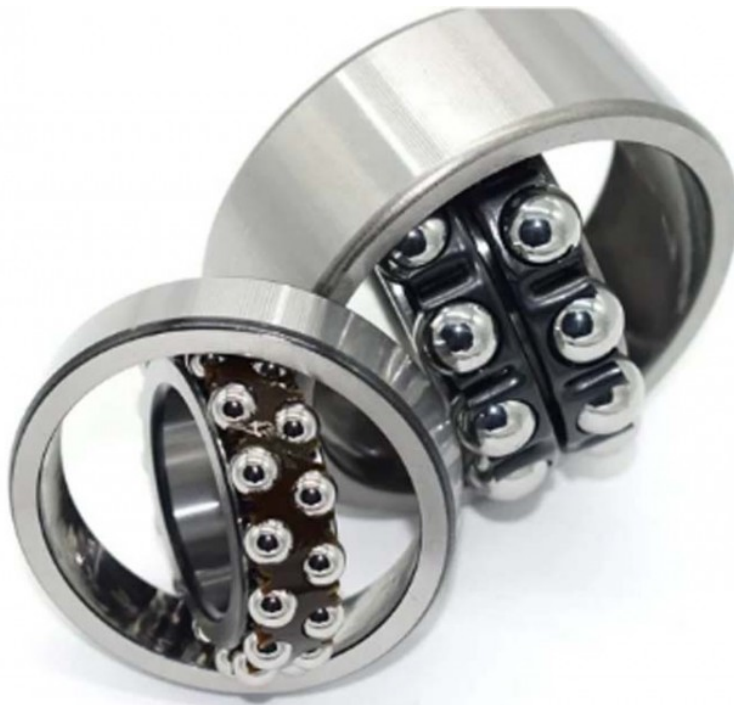
Self-Aligning Ball Bearings

In summary, Self-Aligning Ball Bearings (SABBs) play a vital role in a wide range of industrial applications, offering efficient misalignment compensation and reliable performance under diverse operating conditions. Their versatility, coupled with their ability to improve equipment reliability and reduce maintenance costs, makes them indispensable components in modern machinery and mechanical systems.